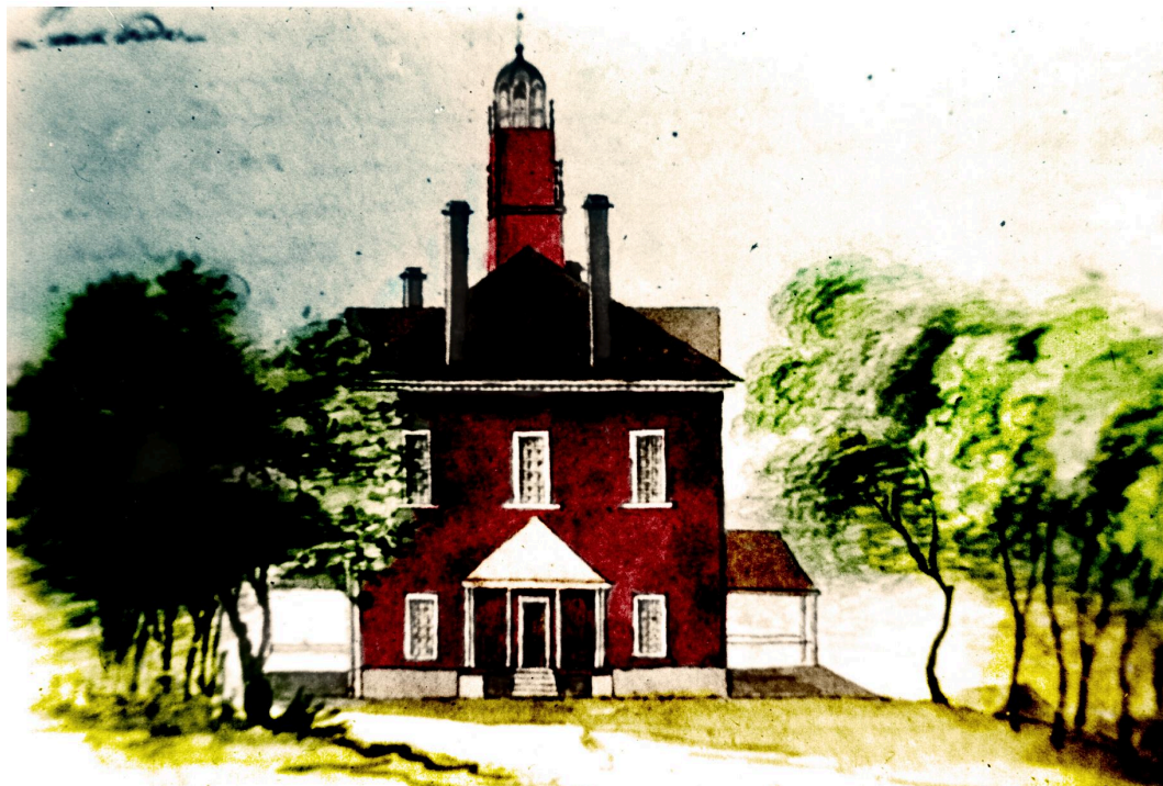
IMAGE 2 - The North Carolina State Capitol, ca. 2021