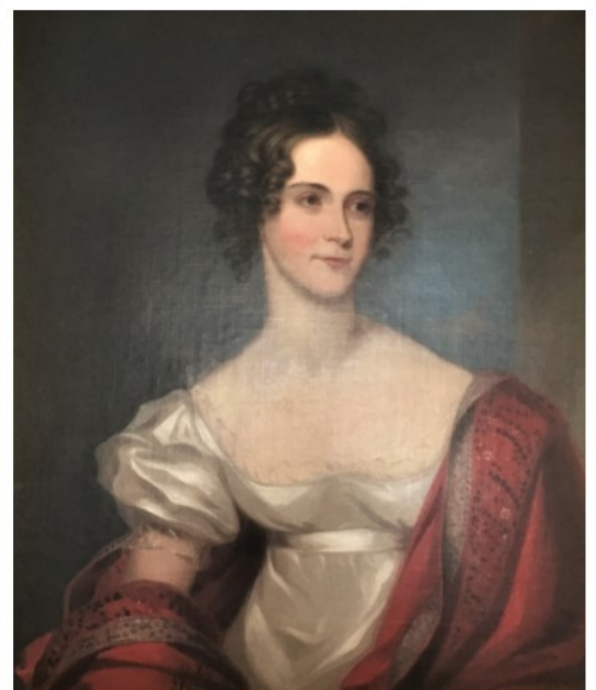
Thomas Sully painting