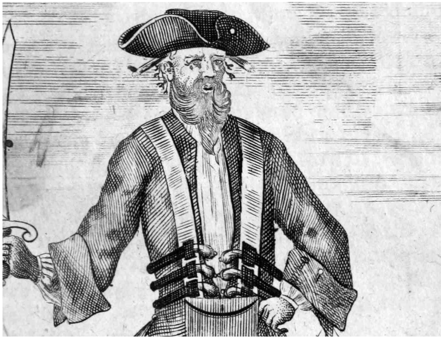
A image of Blackbeard from 1724.