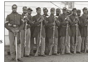
Members of the 4th USCT Regiment

Meanwhile, Confederate soldiers north of Fort Fisher marched south in hopes of reinforcing Fort Fisher and surrounding the U.S. forces. As they marched, they encountered approximately 3,000 African American soldiers (a.k.a. U.S. Colored Troops) holding the U.S. Army's rear line. With many of the USCT regiments experienced in combat, the soldiers refused the Confederate advancement. Even though the USCTs were not selected for direct action against Fort Fisher, their actions contributed to the victory.