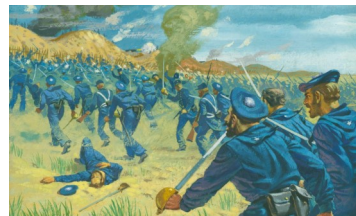
US Navy sailors and marines attack the Northeast Bastion

On the morning of January 13, U.S. troops began their second amphibious landing on Federal Point. Approximately 9,000 soldiers and 2,000 sailors and marines took to the shore.