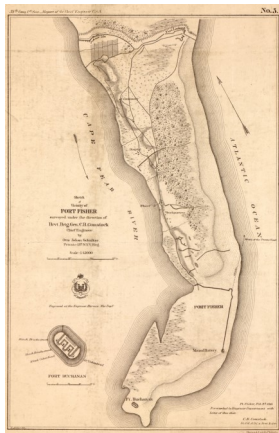
Federal Point in 1865

At the dawn of the American Civil War, the Confederacy took control of a neck of land in southeastern North Carolina near the mouth of one of the inlets into the Cape Fear River. Work soon began to fortify the position to protect trade in and out of Wilmington, the major port city a few miles up the river.