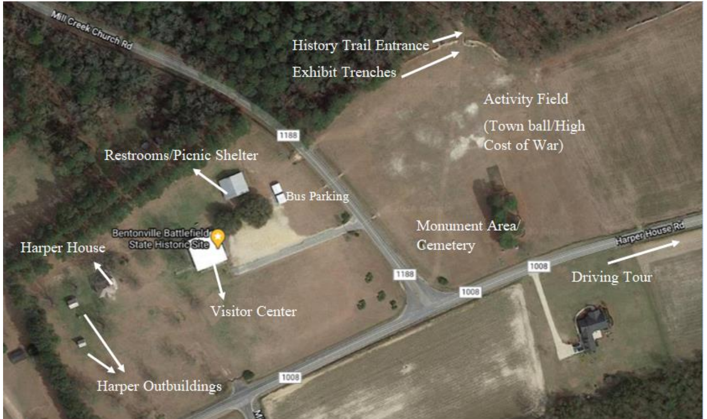
Satellite Map of the Visitor Center area at Bentonville Battlefield State Historic Site