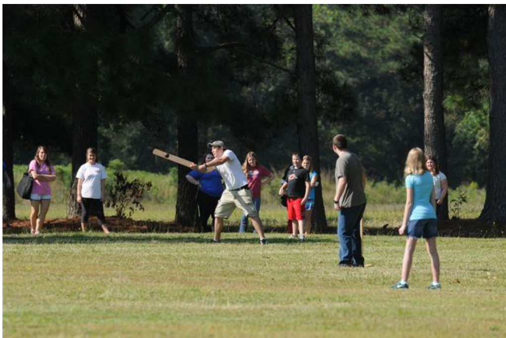
Students play Townball, a 19 th century form of Baseball