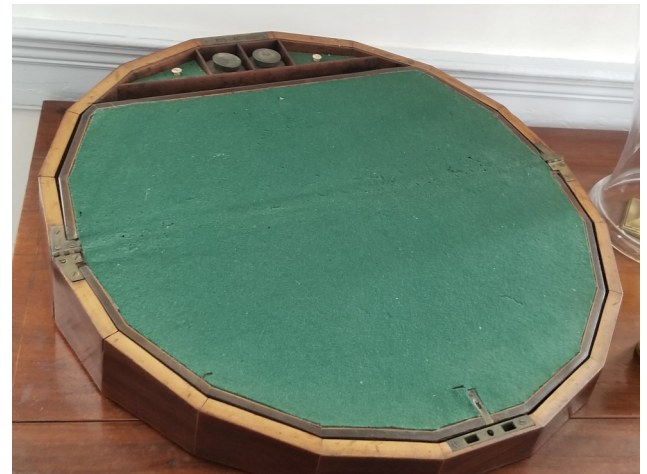
Lap desk dating to the 1790s

In a time without laptop computers and smartphones, the lap desk was the ultimate tool for working on the go. It allowed people to travel away from their desks while still having the ability to write, which was a major way in which people communicated both personally and professionally. There is a beautiful example of a lap desk on display in the Bonner House.