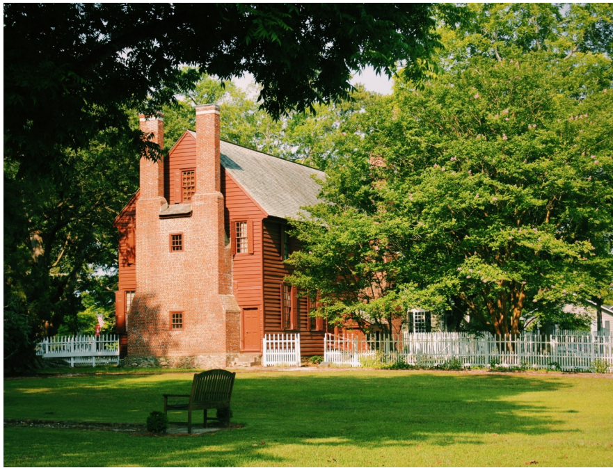
The Palmer-Marsh House